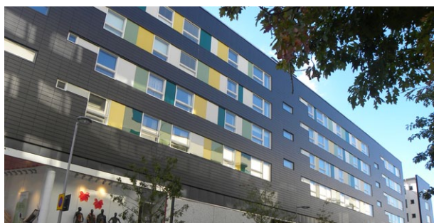
Commercial and residential building, Liljeholmen, Stockholm. Block format 600×200 mm