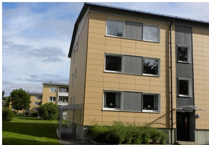
Residential houses, Sundsvall. Block format 1,200×400 mm